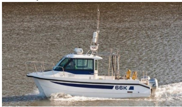
Porth Minnick – Survey Area